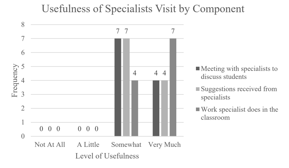
Figure 3. Usefulness of types of interactions with specialists, as reported by teachers.

• "Techniques for modifying classroom instruction and assignments for students, particularly the reminder to have patience"